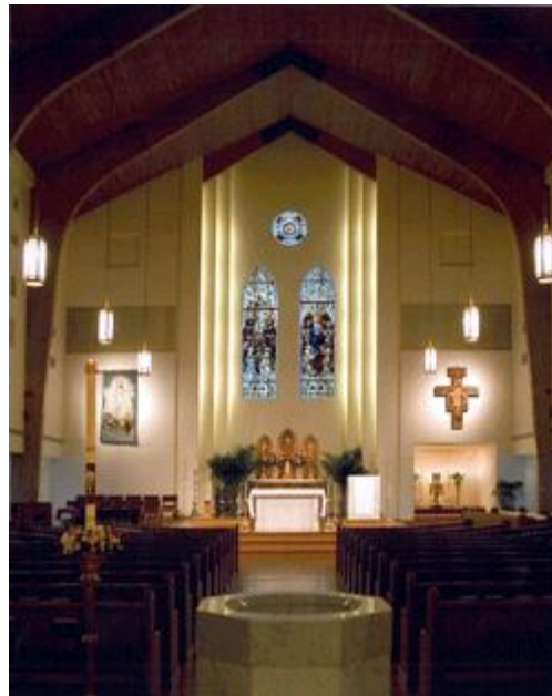
The interior of Blessed Sacrament Catholic Church, 2008

A holiday tradition, these wonderful musicians will help us ring in the Christmas season.